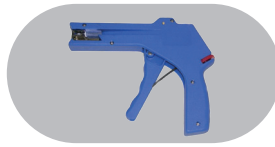
CABLE TIE GUN (sold separately)