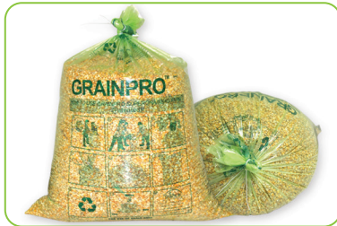
SuperGrainbag Farm Liner